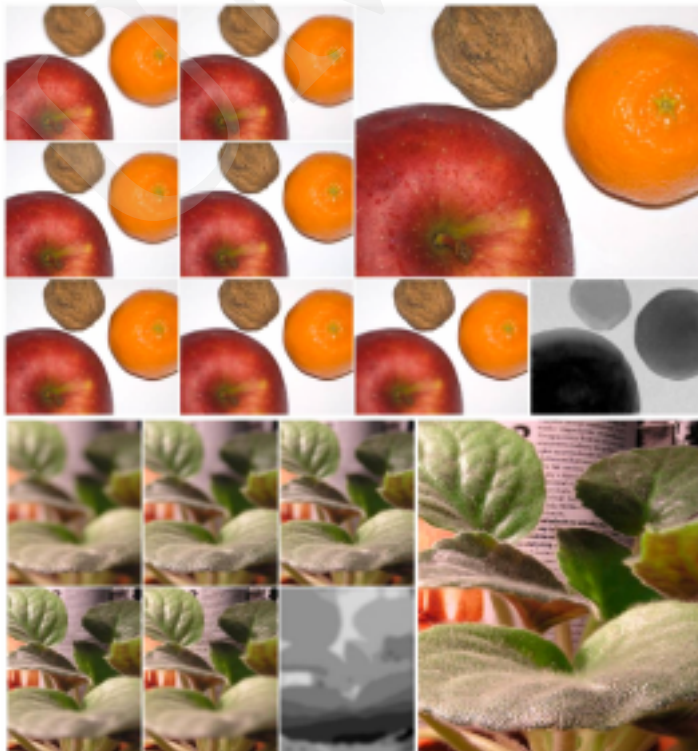
Fig. 3. Multifocus Image Fusion example sets. Small images are part of the original multifocus image set; last small, blurred image is the Height Map; large image is the fused image