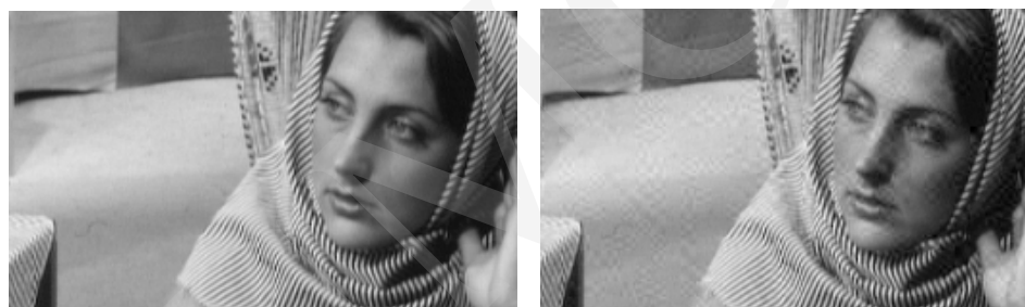
Fig. 5. Fragment of the original test image and its stegoed variant

KLT spectrum of its pixels. Hence, the message is being expanded into a longer sequence of small values e.g. binary ones. Then we have to generate a key which will determine where in the transformed blocks the elements of expanded message have to be placed. The key is a sequence of offsets from the origin of each block. It is important to place the message into the “middle-frequency” part of each block as a compromise between output image quality and robustness to intentional manipulations. This rule is especially significant in the case of images containing a large number of small details, which helps keep all the changes imperceptible. The only noticeable difference can be observed in the areas of uniform color. As an example of the embedding, the following image is presented (see Fig. 5).