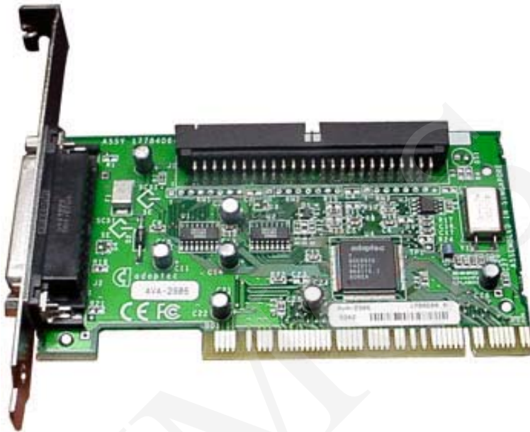
Fig. 2. Adaptec AVA 2906 controller.

For practical reasons (good quality development tools and documentation without restrictive license limits), our work is carried out in the GNU/Linux operation system environment with the application of a gcc compiler.