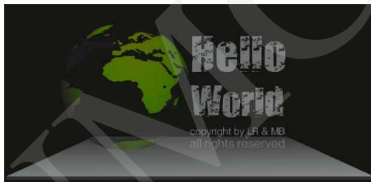
Fig. 5. A complex exhibit with an animated rotating object and a column of text labels.

The above line creates a Slide exhibit, which will contain a title and a bullet list in a column. The Slide constructor creates Label objects out of the string constants and determines their size. The title will be automatically resized to take up the whole exhibit width and the bullets in the list will be resized to have the same font size.