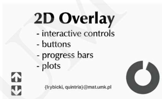
Fig. 4. Presentation of the 2D Overlay: two buttons, a static label and a circular progress gauge to-gether with a slide exhibit.

up.onClick = &display.camera.forward; down.onClick = &display.camera.back;