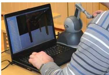
Fig. 5. The photo of the computer screen with the application dedicated to control the manipulator platform.

In the other screen window or on the second computer screen the camera image is displayed. The use of the second screen is not a problem since in practice, today each notebook is equipped with video output for an external computer monitor and a computer operating system is ready to use it.