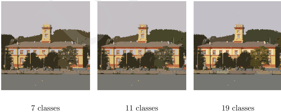
FIG. 5. Segmentations of building_1 test image chosen based on the F and Q function values. The following parameters were used during the over-segmentation – clustering method: CLINK , watershed attributes: average and variance , standardization: none .

factor in the assessment function increases, but the colour error does not significantly decrease.