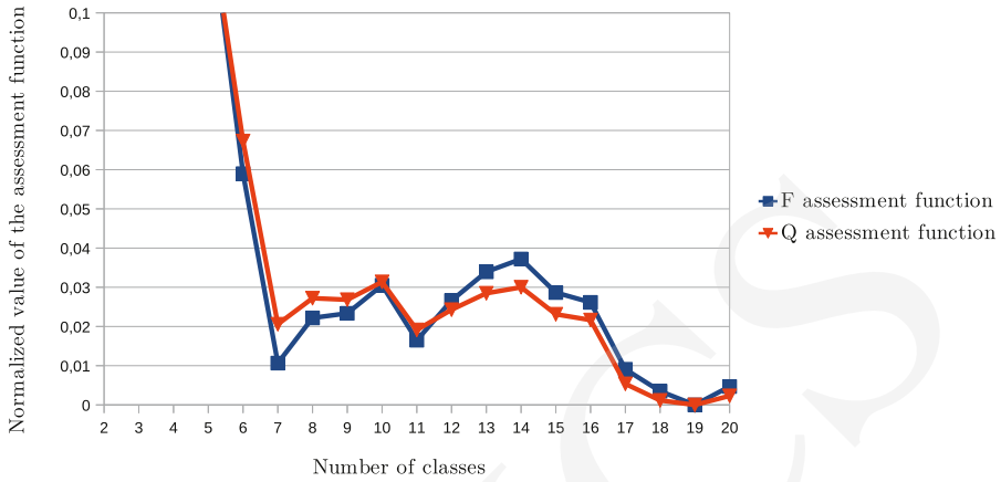
FIG. 4. Graph showing the dependence of the functions F and Q on the number of classes for the building_1 image. The function values were scaled to the interval of [0; 1] . The chart shows only the [0; 0, 1] range in order to make local minima more visible.