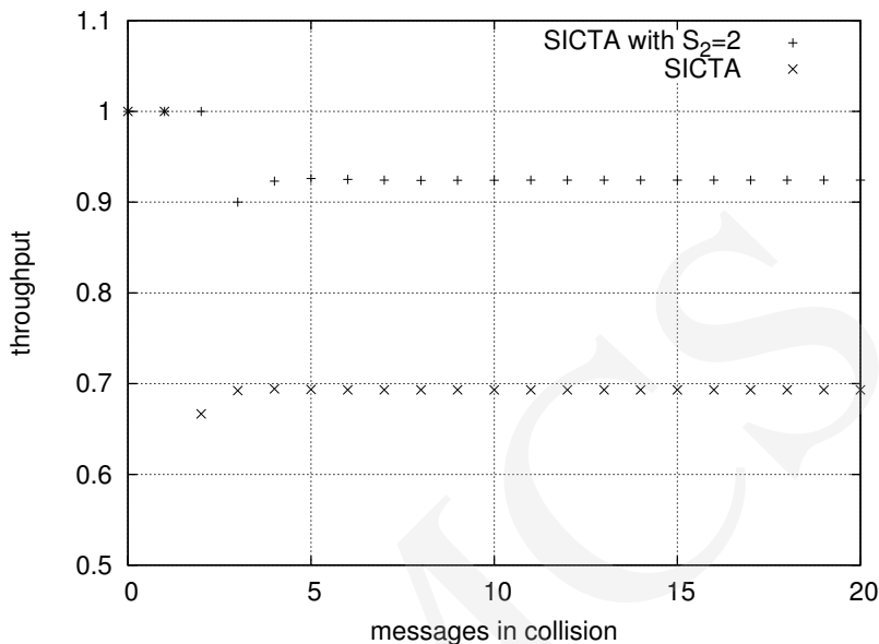
RYSUNEK 2. Performance of collision resolution with SICTA.

that he could not have computed before. For instance one can prove the equality of discrete logarithms to different bases, and logical \wedge (and) and \vee (or) combinations of such statements [1]. It is also possible to prove the inequality of logarithm to different bases [2].