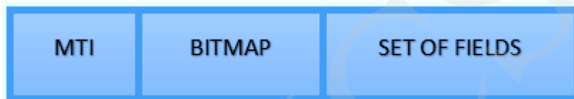
FIG. 2. Structure of ISO 8583 message

The whole standard is defined in ISO 8583 Financial transaction card originated messages Interchange message specifications. It is the binary protocol defined by International Organization of Standardization and intended for the systems that exchange electronic transactions made by cardholders using payment cards. ISO 8583 defines a communication flow and a message format so that different systems can exchange these transaction requests and responses [5]. Fig. 1 presents the structure of ISO 8583 message.