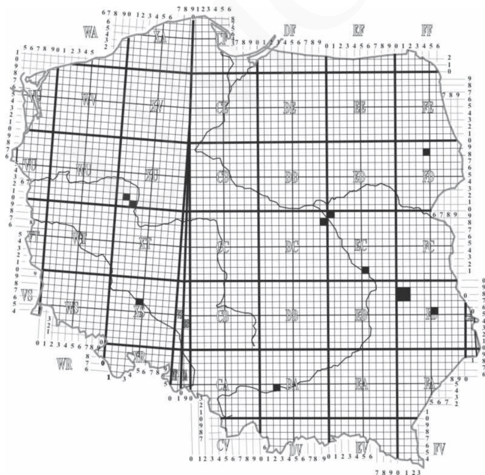
Fig. 4. Distribution of Uloborus plumipes in Poland.

First time recorded from Poland in 2001 from Białystok (101). Since 2002, this species was collected and observed in a number of localities in Lublin, and in several other Polish cities (87). Bigger populations which occur in large garden centers in Lublin may be described as semiautochthonic. They are formed by individuals reproducing partially in place, but these populations are still supplied with a number of specimens coming from almost every transportation of ornamental