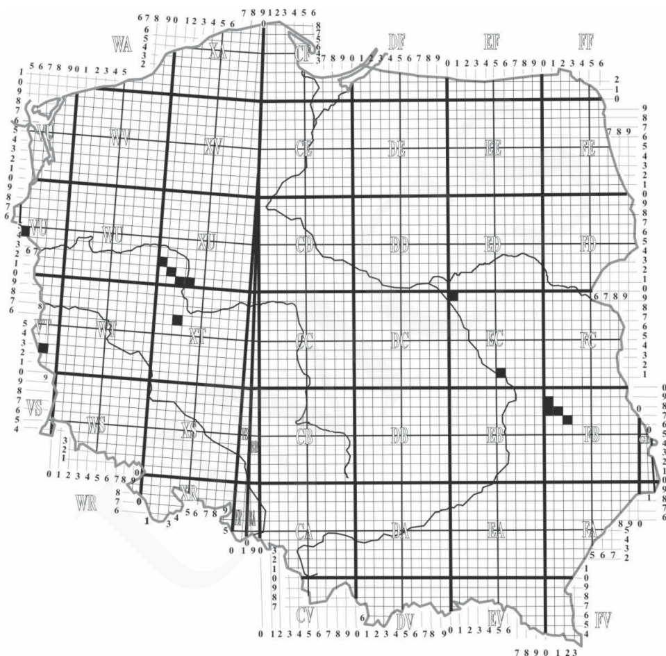
Fig. 6. Distribution of Ostearius melanopygius in Poland.

which enables O. melanopygius to disperse and create new populations almost everywhere (potted plants, pots, packaging, etc.). Apart from anthropogenic dispersion, an additional factor facilitating the expansion of O. melanopygius are its large aeronautical capabilities (30, 96). Early spring finding of gravid female in the litter in Lublin may also suggest accommodation of O. melanopygius to wintering in natural biotopes.