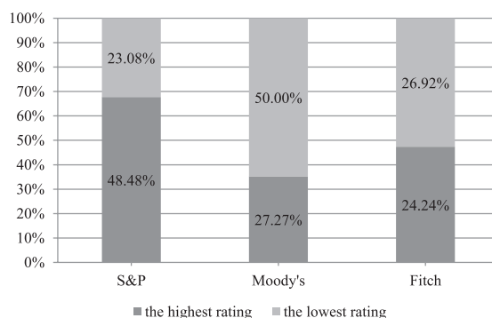
Figure 3. The highest and the lowest rating awarded by agencies

Furthermore, the analysis of the ratings awarded to the issuers by individual agencies was carried out, in order to check which agency gave the highest and the lowest credit ratings. For this purpose, the issuers which received the ratings from two or three agencies were analyzed. The issuers which received the rating only from one agency were excluded from this sample. The analysis does not also include the situations where the assessment of the agencies was the same.