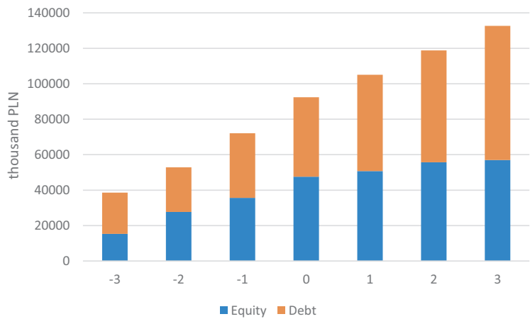
Figure 1. The size of equity and debt in years -3 to +3