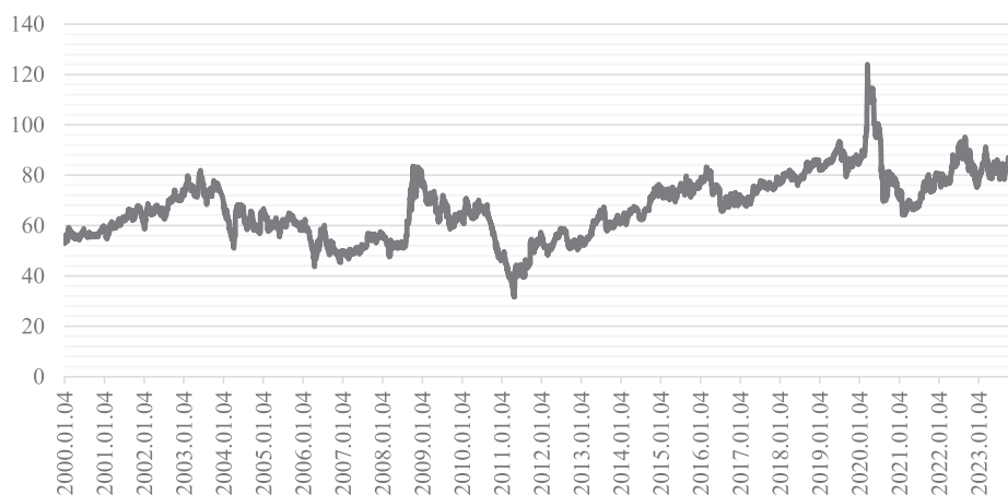
Figure 1. Price relation between gold and silver (gold/silver ratio) in the period 2000–2023

Adding to that, relating our findings to gold/silver ratio from the previous centuries, as we entered the 21 st century, irreversible changes in monetary policy took place, which meant that we no longer have to deal with the gold/silver ratio at such levels as in the 19 th and 20 th centuries. However, it can be noticed some repeatability in the channels (Figure 1) in which this ratio moves and the value of the 80:1 level for trends, which is both the level of support and resistance.