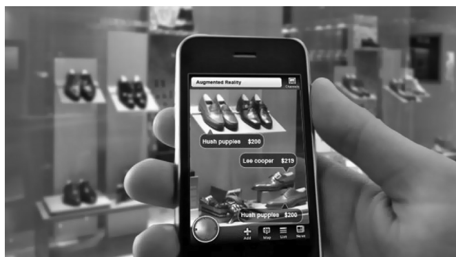
Figure 1. Augmented reality in the point of sale – a shoe shop

land, AR utilization for marketing purposes is still rare, but in the world it develops faster and faster. AR can also add variety to any kind of events, fairs, or business meetings, as well as occasional parties 3 . Figure 1 presents the possibility to use AR in the point of sale – a shoe shop.