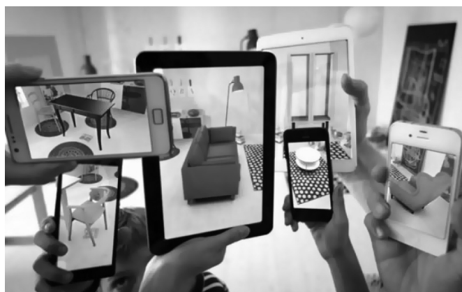
Figure 2. Augmented reality – IKEA

Other AR applications in marketing can be presented on the example of IKEA, where AR allows one to see the furnished interior through the AR overlay with pieces of furniture being accessible in IKEA shops (Figure 2).