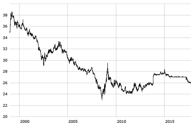
Figure 3. Fluctuations in the crown's rate in relationship to the euro, 2000–2017