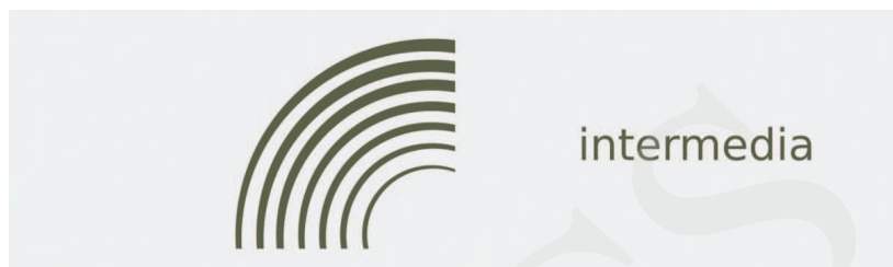
Figure 5. Intermedia for interpretation