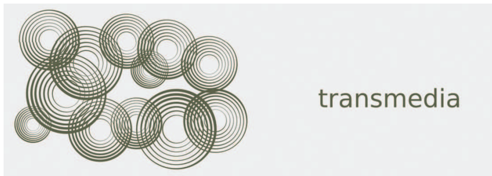
Figure 4. Transmedia to create own world

Zooming out from the landscape of new media pond, transmedia requires the widest-angle lens (Figure 4). Transmedia contribute to the creation of a new world resulting in complex networks of meanings and symbols via various atomic and crossmedia.