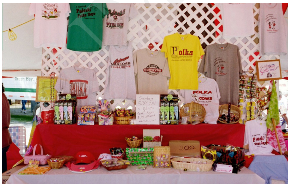
Figure 6. Souvenir Tent at Pulaski Polka Days, 2004.

This resilience is also seen in the polka community’s ability to sustain an independent polka economy, a community-based business alternative to the mainstream of corporate music production (Gunkel 2004, 414). [See Figure 6] In addition to the festivals and conventions, this economy includes polka recording studios, production and distribution, record and CD labels, polka record stores, polka Radio shows polka cruises and travel, polka internet sites, polka associations such as the IPA (International Polka Association) and UPA (United Polka Association), and polka publications. [See Figure7]