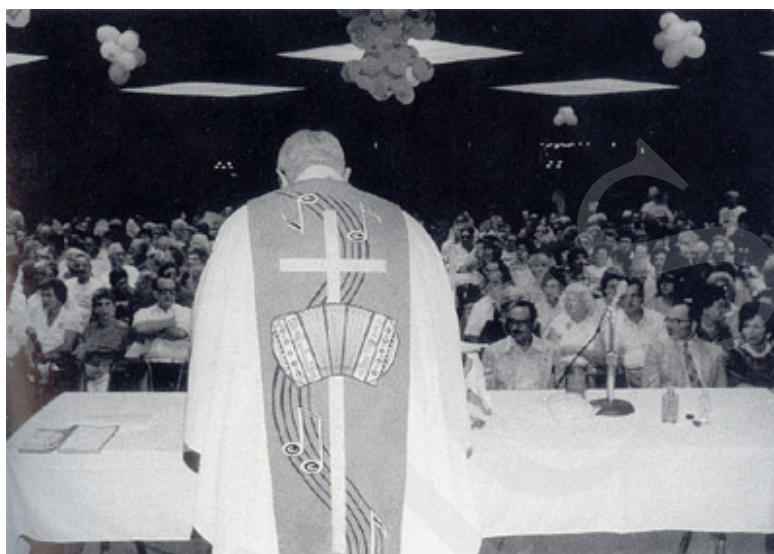
Figure 3. Priestly vestments at the International Polka Association's Polka Mass, 1983.