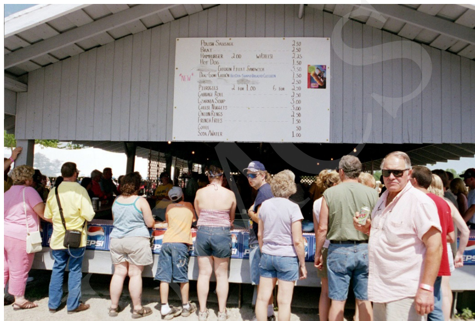
Figure 8. Food Concessions at Pulaski Polka Days, 2004.

Duck's Blood Soup], a dish virtually unknown in contemporary Poland (even absent from Polish dictionaries) but a classic for late nineteenth century émigrés from the Prussian partition of Poland. Five generations later, Polishness means Czarnina .