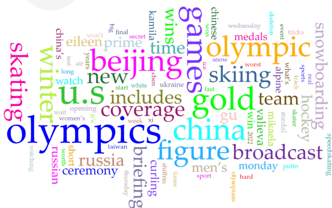
Figure 2. Words with frequency greater than 3 in the New York Times

As shown in the figure, the high-frequency words in the People's Daily are closely related to the research topic. The most frequently used term is literally “Beijing 2022 Winter Olympics” itself. Additionally, there are no negative terms observed in the figure.