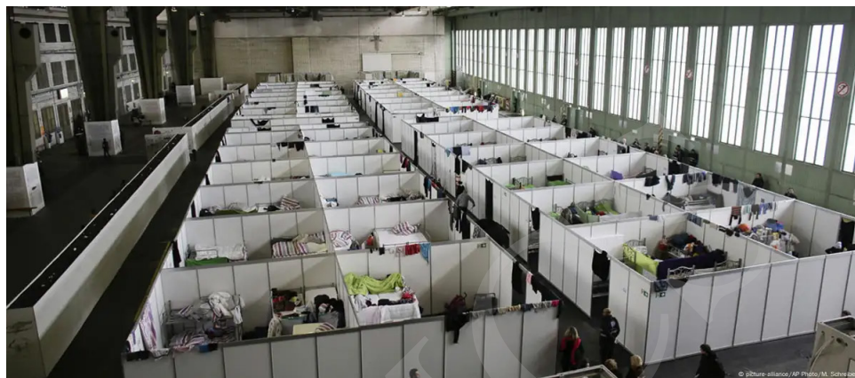
Picture: the refugee accommodation in the hangar of the airport Berlin Tempelhof, 2016