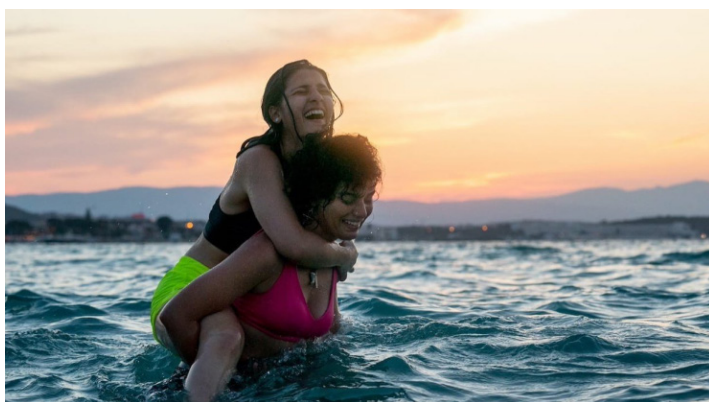
The Swimmers (2022), promotional picture for the movie

The movie The Swimmers (USA & UK, 2022) tells the real story of the teenage sisters Yusra and Sarah Mardini who fled their home in Syria due to the war. Dive into their inspiring story with our in-depth look at the movie and our survey on it. Discover how this powerful film is changing perspectives on the refugee crisis and resonating with audiences worldwide.