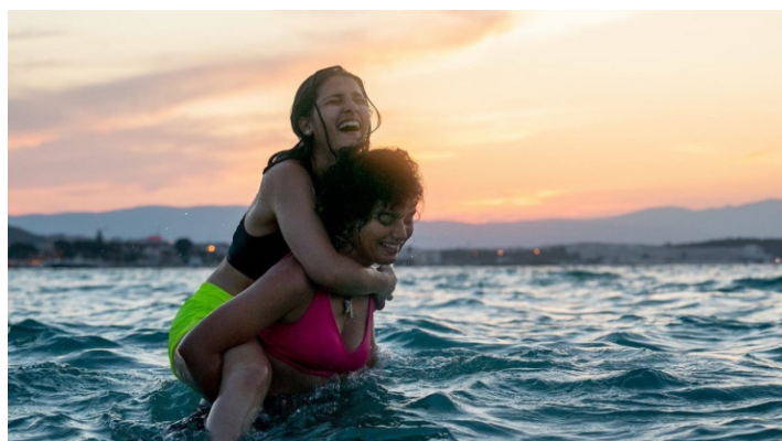
The Swimmers (2022), promotional picture for the movie

The movie The Swimmers (USA & UK, 2022) tells the real story of the teenage sisters Yusra and Sarah Mardini who fled their home in Syria due to the war. Dive into their inspiring story with our in-depth look at the movie and our survey on it. Discover how this powerful film is changing perspectives on the refugee crisis and resonating with audiences worldwide.