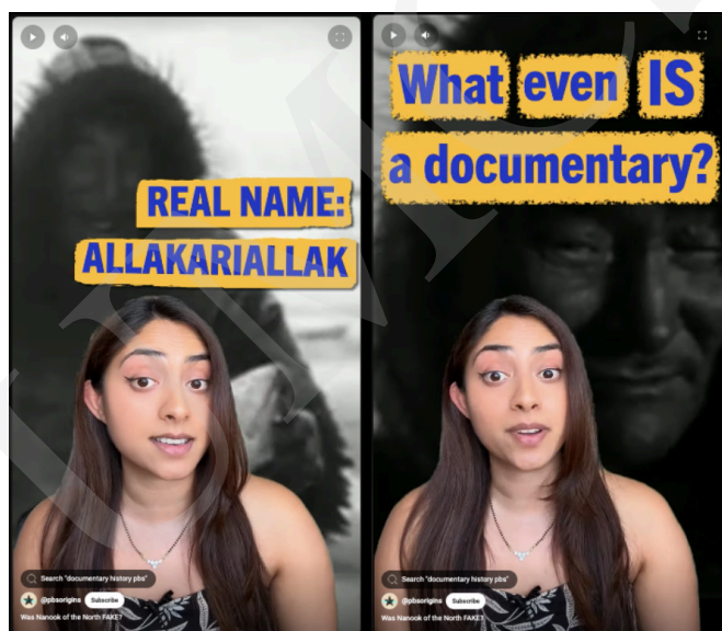
Fig. 6 Stills from YouTube short "Was Nanook of the North Fake?" posted by @pbsorigins, https://www.youtube.com/shorts/459aD4QxPBE

2012, Tagaq and a group of collaborators composed a new soundtrack for Nanook that was first performed at the Toronto International Film Festival that year. In doing so, Tagaq and company worked to counter the film's problematic legacy through sonic intervention, an eclectic soundscape centering Tagaq's neo-traditional Inuit throat singing. "Even though I have no doubt in my mind that Robert Flaherty had a definite love for Inuit and the land," she says, "it's through 1922 goggles" (ibid.). As such, the composition of a new soundtrack for the film is an effort to reclaim Nanook in a way that does not call for the film's erasure, but rather a thorough reconsideration in light of its enduring impact on the Inuit people.