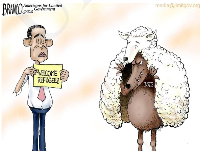
Figure 2. Representation of refugees as a lurking danger (ALG, 2015)

Source: E. Pluribus Unum. “Cartoons.” 2017. Accessed June 10. https://epluribusunumjcom2010.wordpress.com/cartoons/ .