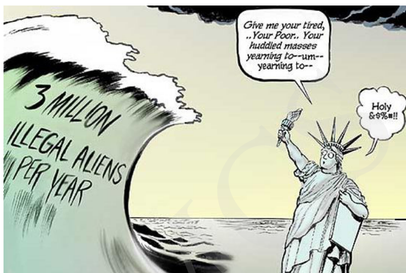
Figure 1. The alien tsunami that scares even the Lady Liberty (CNS News.com, 2010)

Source: E. Pluribus Unum. “Cartoons.” 2017. Accessed June 10. https://epluribusunumjcom2010.wordpress.com/cartoons/ .