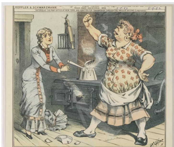
Figure 7. An overbearing Irish maid ( Puck , 1883)

Source:“(Bad)Luck of the Irish in Political Cartoons.” 2017. Accessed June 17. https://hsp.org/blogs/fondly-pennsylvania/bad-luck-of-the-irish-in-political-cartoons .