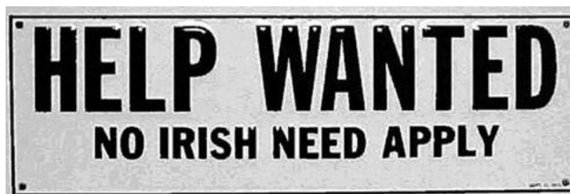
Figure 4. The so-called NINA sign

Source: Dooley, Michael. "Editorial Cartoonist Thomas Nast: Anti-Irish, Anti-Catholic Bigot?". 2017. Accessed June 14. http://www.victoriana.com/history/irish-political-cartoons.html .