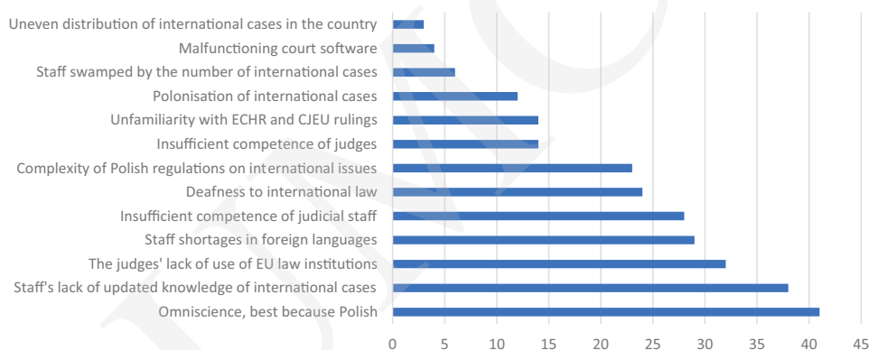
Figure 3. Main problems of Polish courts in international elements by lawyers surveyed (aggregated number of indications in interviews)

The lawyers who participated in the survey, drawing on their extensive experience within the judicial system, compiled a comprehensive catalogue identifying a range of issues perceived in Polish courts, particularly among court staff and judges, regarding the application of international and European Union law in routine judicial proceedings. The insights provided by these legal practitioners uncover a pervasive array of problems and deficiencies within the framework of the Polish judiciary.