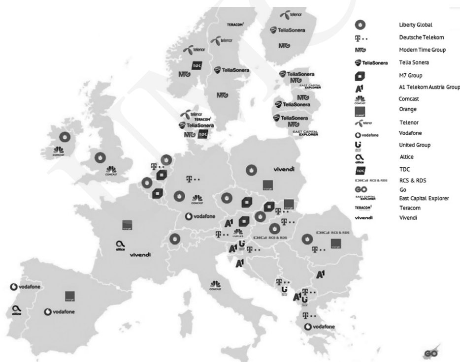
Figure 1. Pay AV services by ownership, geography segmentation (2017)

Figure 1 shows how closely the markets in each Member State are interconnected through the largest service providers. It is clear that most consumers in the Member States are fighting for the majority of consumers, that means that in most cases we can talk about limited competition.